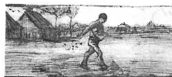
Vincent Van Gogh, "The four seasons" (1888)